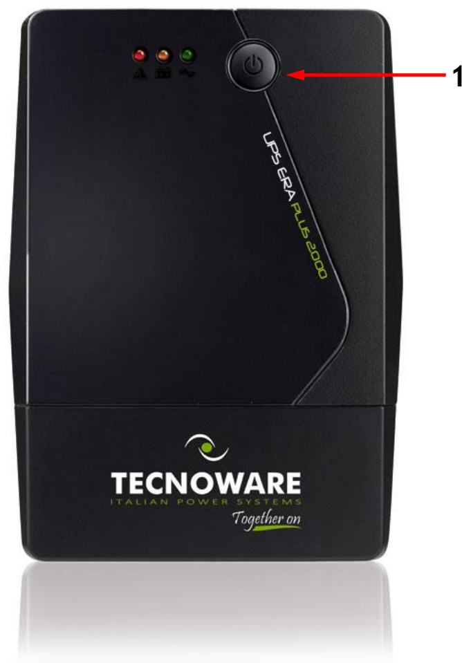
Figure 1 - Front panel