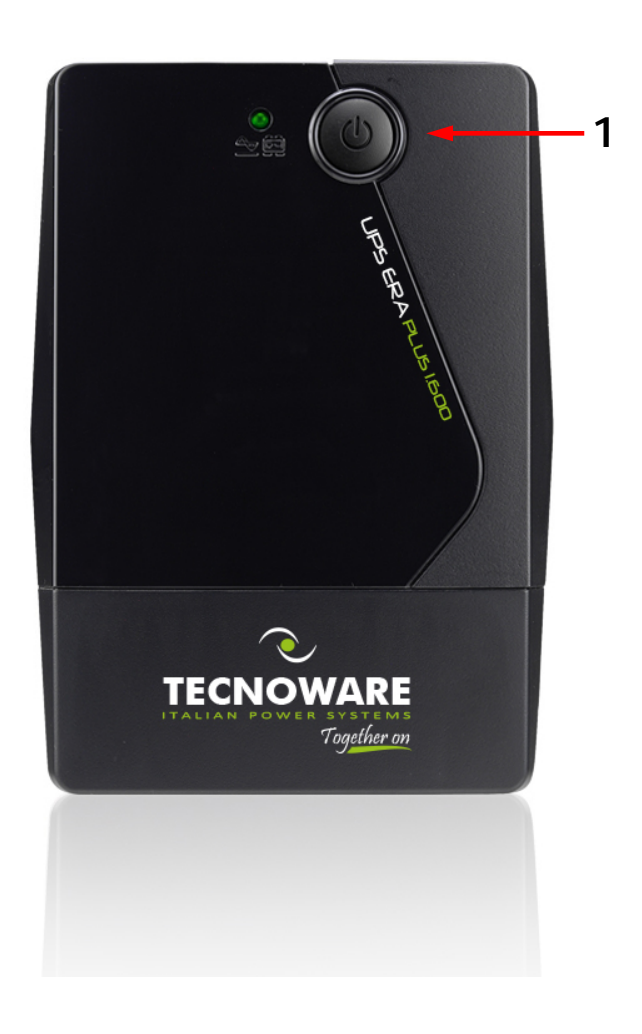
Figure 1 - Front panel