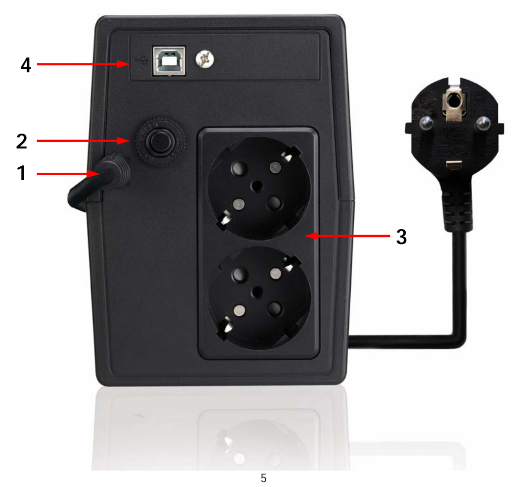
Figure 2 - Rear Side